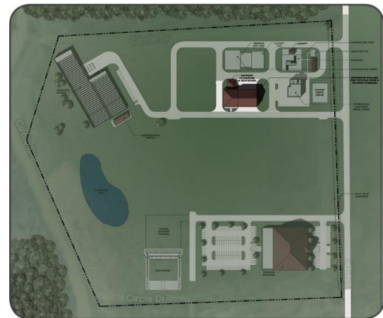
Multi-purpose training facility, outdoor classroom