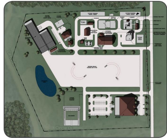
Campus Master Plan