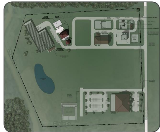
Live fire shoot house, outdoor classroom