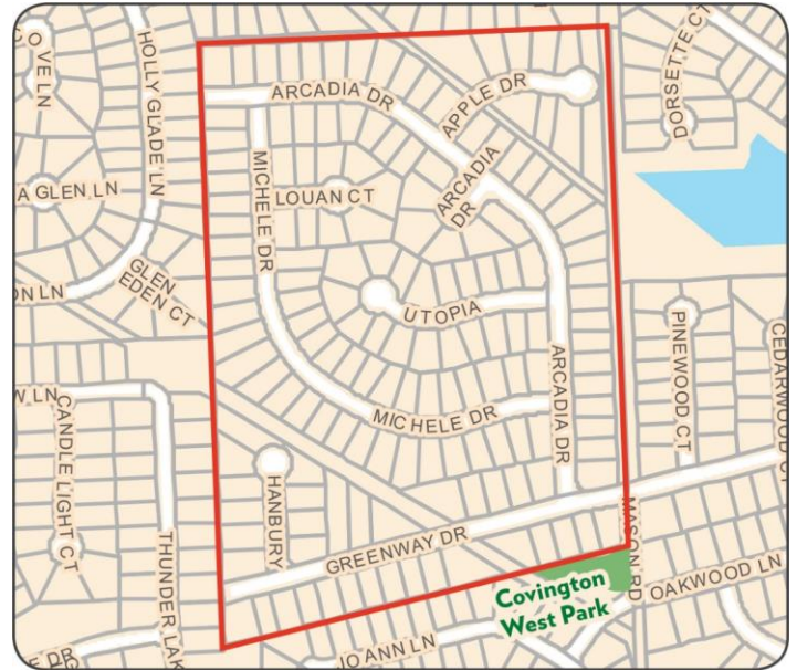
Covington West Neighborhood